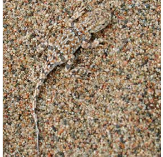
Optimal matching of gloss level, surface and colour shade

When opting for liquid coatings, solvent-based baking systems are often used. Based on the requirements placed on these, FreiLacke's fundamental idea was to develop a corresponding water-borne baking system. The system coating concept, high aesthetic and surface requirements and application under series production conditions were the key tasks surrounding the development of a modern baking system that would also meet environmental standards. FreiLacke was able to attract project partners in the steel furniture industry for the development of a corresponding baking coating system. Below you will find an example describing how one German steel furniture manufacturer successfully switched to the new system.