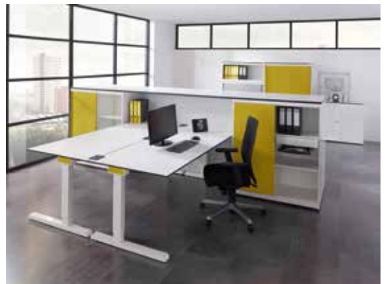
Images 1 and 2: Office equipment of Mauser Einrichtungssysteme GmbH & Co. KG in standard colour shades (left) and in combination with custom colour shades (right)