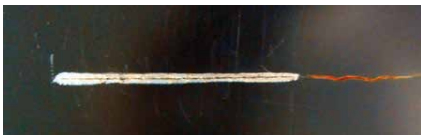
Fig. 3: Results of salt spray test after 168 hours: Creepage 2 mm